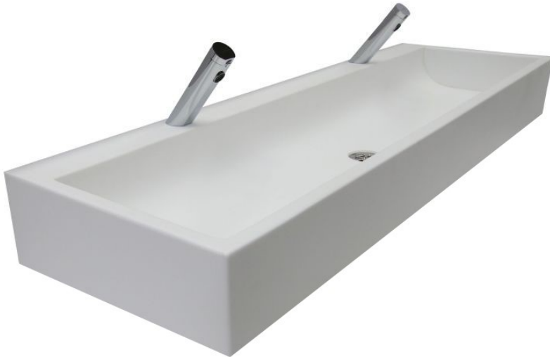
Vanity sit-on model (vanity unit by others)